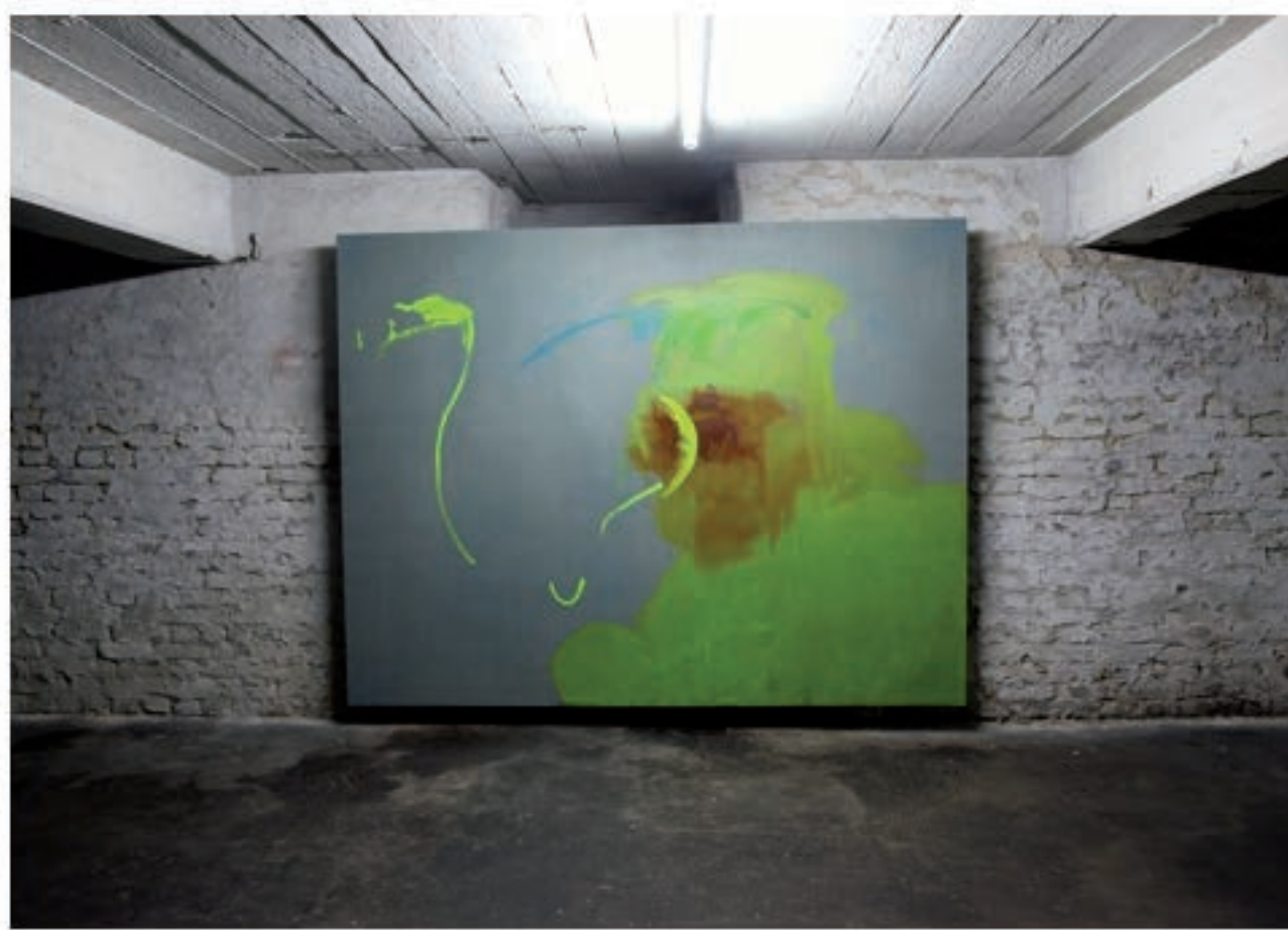
Benjamin's aura better explained

GALLERIES: WE ALSO HANG UP YOUR WORKS FOR YOU—WELL, KINDA—CHECK OUT OUR SWARM AND JOIN THE BUZZ!